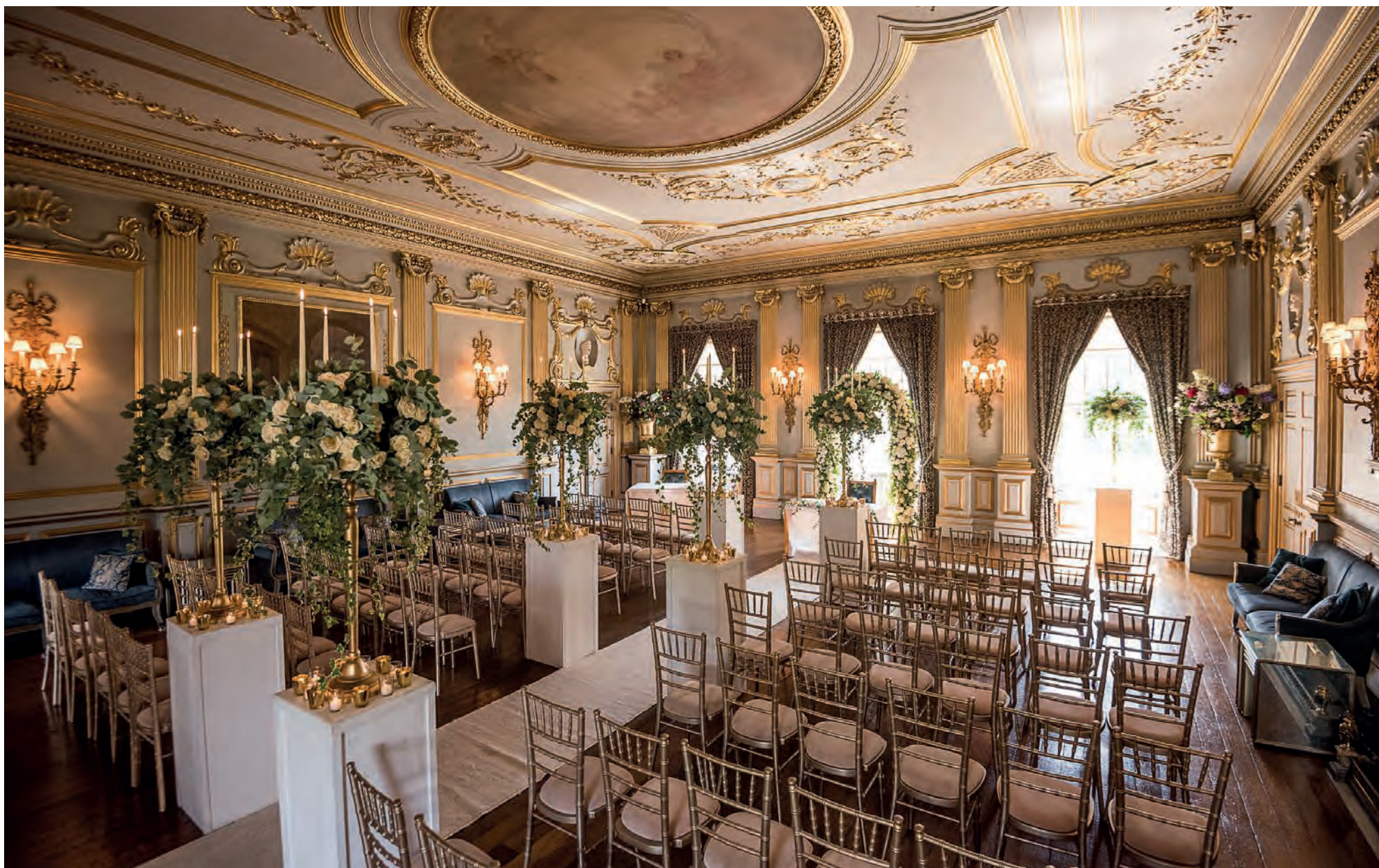
Chairs courtesy of Childwall Table & Chair Hire. Room decoration by external supplier

Knowsley Hall is, without doubt, an idyllic place to take your vows. Your photographs will be testament to a joyous day that is truly magical. And, of course, you will be adding your own unique experience to the estate's remarkable history.